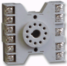
LD-11 Socket DIN Rail Mountable