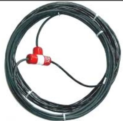
PR-XX Preformed Loop with internal lightning protection