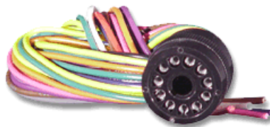
HAR-11 3 foot Harness