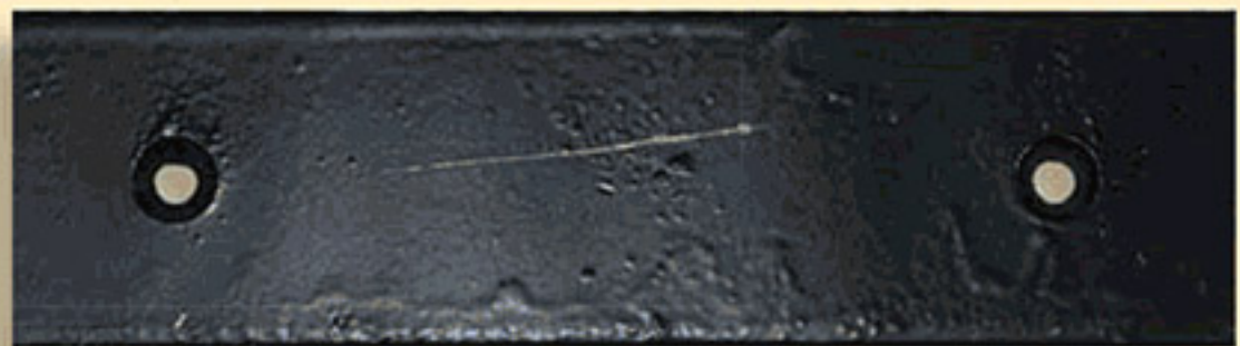
Close up of Deliberate Scratch shows little rust, no rust migration, and no detachment of the surface coating