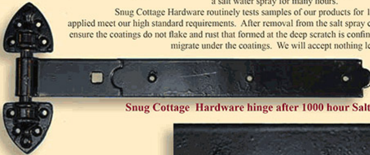
Snug Cottage Hardware hinge after 1000 hour Salt Spray Test

Snug Cottage Hardware routinely tests samples of our products for 1000 hours to ensure the finishes applied meet our high standard requirements. After removal from the salt spray cabinet product is examined to ensure the coatings do not flake and rust that formed at the deep scratch is confined to the scratch and does not migrate under the coatings. We will accept nothing less