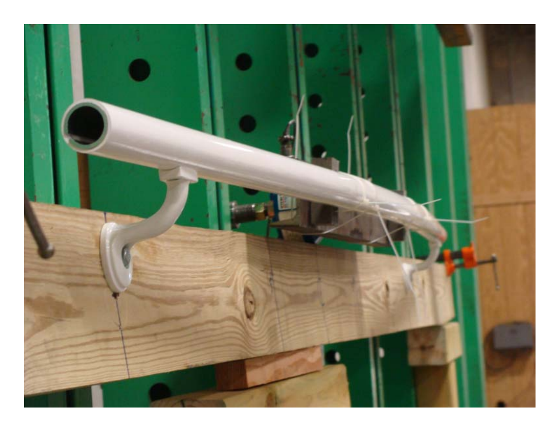
PHOTO 3: 50 plf Load Applied – Horizontal (photo taken at 300 lbf)