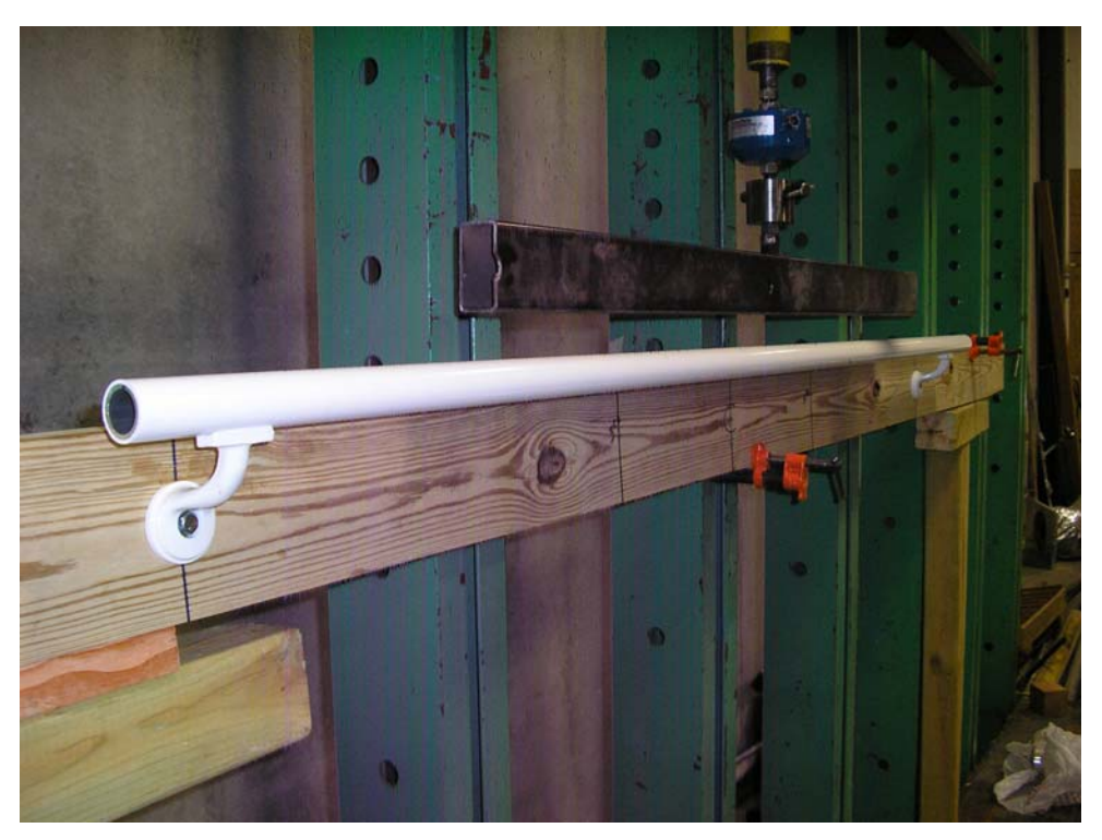
PHOTO 4: 50 plf Load – Vertical (photo of set-up, no load applied)