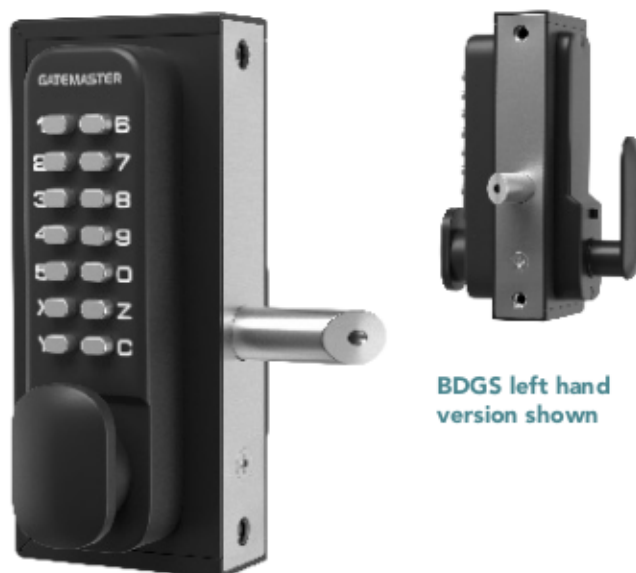
BDGS left hand version shown