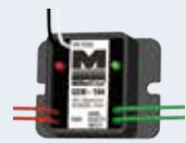
GATE EDGE MODULE GEM-10X