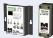
MONITORED GATE LINK MGL-K20