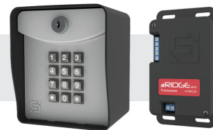
14-500 Ridge 2.0 433-MHz Keypad and Transceiver

For more information, visit us online: securitybrandsinc.com