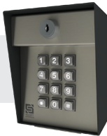
26-500 Post Mount