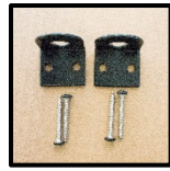
Contemporary Guide Brackets (6096 Drop Rods)