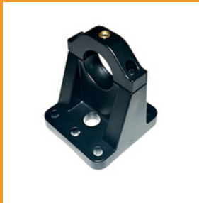
Ball & Socket Mounting Bracket