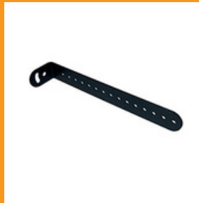
Reflector Extension Bracket