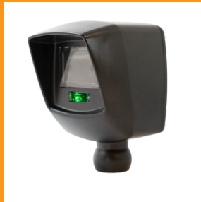
Integrated Sensor Hood