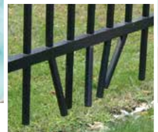
Bufftech vinyl fence outperforms aluminum fence.

Aluminum fences simply aren't as durable as vinyl. Aluminum fences are prone to kinking and bending, particularly when they come into contact with lawn mowers, shrubbery and tree limbs. And while aluminum fences, like vinyl, offer low maintenance, the style and color options for aluminum are very limited. If you're looking for privacy, you're not going to get it with an aluminum fence.