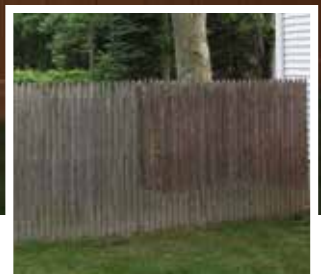
Bufftech vinyl fence outperforms wood fence.

Out of all types of fence materials, wood fences demand the most maintenance and can end up being the most costly. Wood fences must be treated, painted or stained on a regular basis; in fact, the average wood fence owner can expect to spend time and money painting or staining every few years to maintain the fence's appearance and to protect the wood from weathering. Wood that is exposed to the elements will eventually rot over time, resulting in a less stable fence with a shorter life span.