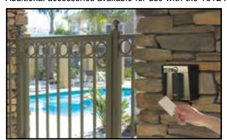
RS-485 Proximity Card Reader

Additional accessories available for use with the 1812 Access Plus. Each uses RS-485 communication protocol.