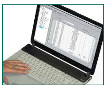
pc programmable Program the 1812 Access Plus from your PC