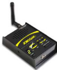
JBS Base Station