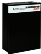
Logic Controller/ Power Supply

The DE EasyKits provide a secure 2-point locking system with 15-second delay and 100dB alarm when someone attempts to exit. The DE EasyKit is ideal for retail stores, healthcare, assisted-living facilities, childcare, sports arenas and any location where a special locking delayed exit is required to prevent theft or to protect those trying to exit.