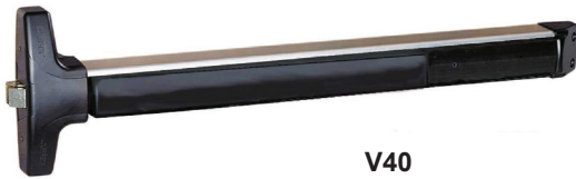
V40 (628 Finish)

The V40 Series rim exit device is secure and durable panic and fire exit hardware at an economical price. It is designed for use on all types of single and double doors with mullions. The patented mounting plate and strike locator system ensures the easiest and most accurate installation of panic hardware available.