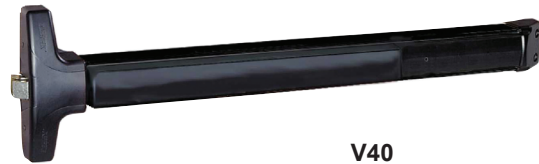
V40 (711 Finish)

Wide Stile shown, for Narrow Stile, specify NS Option (for use on 36" and 48" doors with 2" stiles).